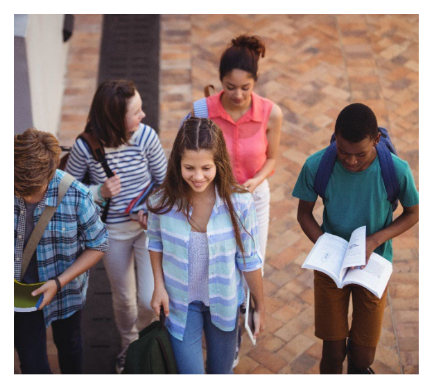
administrative staff (Cohen et al., 2009).

School climate extends beyond the physical aspects of the school, such as the infrastructure and resources, to encompass social interactions, and emotional experiences (Rohatgi & Scherer, 2020). School climate includes physical and social-emotional safety within the school, the quality of teaching, relationships between students, teachers, and administrators, and aspects of the structural environment (Cohen et al., 2009; Rosenholtz, 1989). Perceptions of a positive school climate are determined by the quality of relationships between individuals within the school, the teaching and learning that takes place, and the collaboration and support between educators and